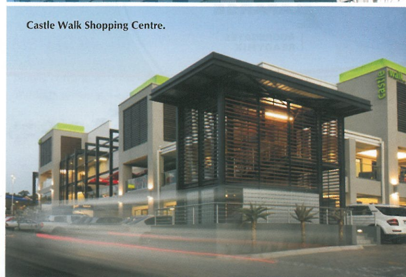
Castle Walk Shopping Centre.