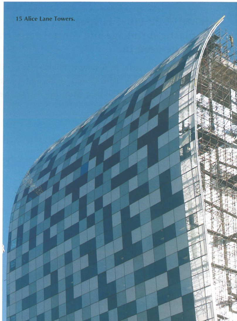
15 Alice Lane Towers.

Castle Walk Shopping Centre, owned by the Public Investment Corporation (PIC), took top honours in the refurbishment category, with Boogertman + Partners appointed to design the external refurbishment of the development to create a fresh and modern facelift to the building.