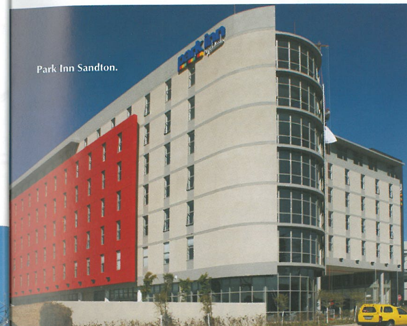
Park Inn Sandton.