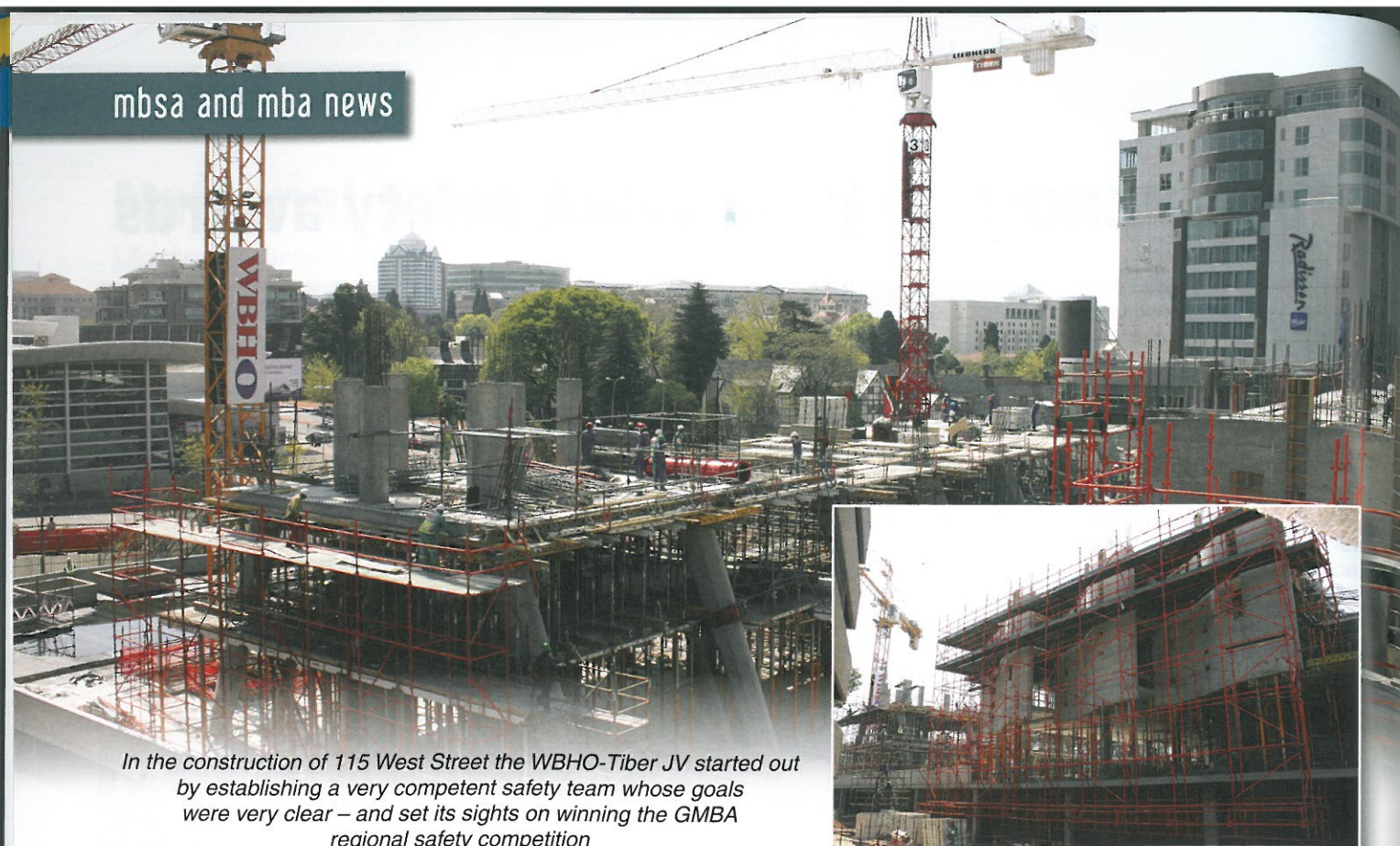
In the construction of 115 West Street the WBHO-Tiber JV started out by establishing a very competent safety team whose goals were very clear – and set its sights on winning the GMBA regional safety competition